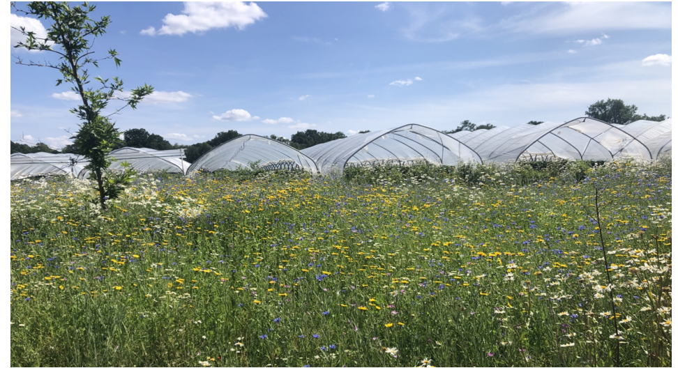
Agrisound - 18 devices located on farm, monitoring insect activity